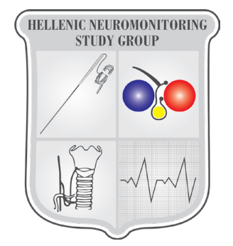
Under its auspices