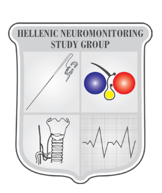
Under its auspices